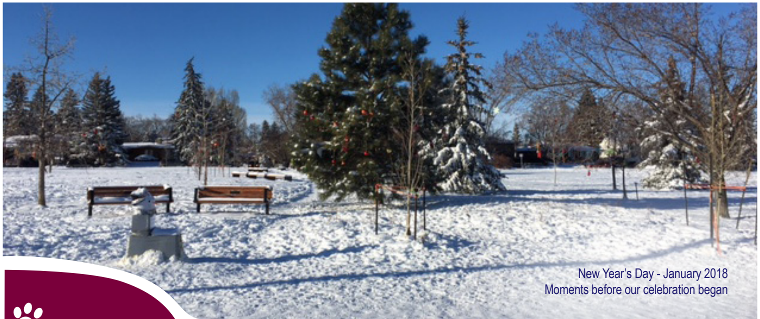
New Year's Day - January 2018 Moments before our celebration began