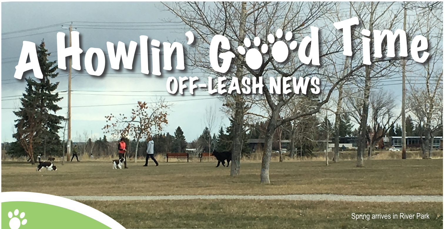
Spring arrives in River Park